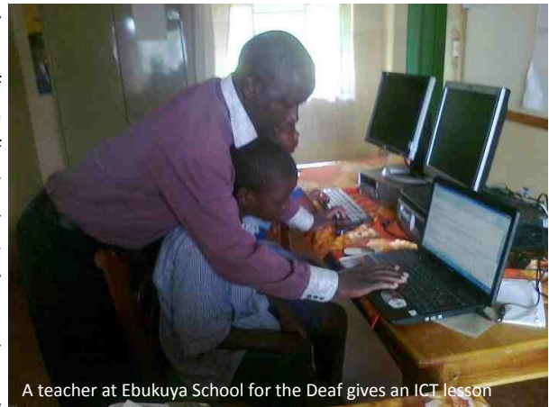
A teacher at Ebukuya School for the Deaf gives an ICT lesson

We would like to thank all of you for your generous donations last year for the Luanda project. Both in school and out of school, we managed to fundraise £18,000 for the project which included the cost of travel and accommodation, and also nearly £3,000 donations for our five partner projects in Kenya. These donations went towards computers for Ebukhiliti Primary School and the Ebukuya School for the Deaf, filling the library in the Ebukuya Primary School, a floor for the new science laboratory in the Ebusiratsi Secondary School and improving the catering and accommodation facilities for the St Joseph's Rehabilitation Centre (a project for streetchildren).